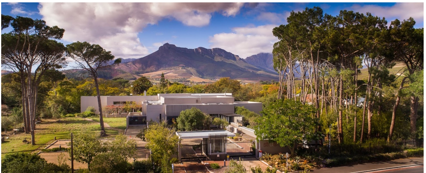
Stellenbosch Institute for Advanced Study – STIAS

We would welcome your input! If you have suggestions, please contact any of the Council or Student Council members, as appropriate.